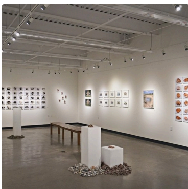
Deo ~90 linear feet of exhibit wall space; ~702 sq foot space.

Security: Both galleries have video monitoring, but are not staffed.